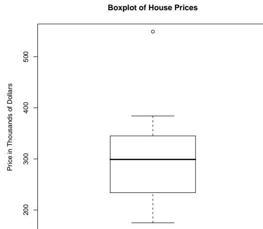
Figure 1: Box Plot of House Prices