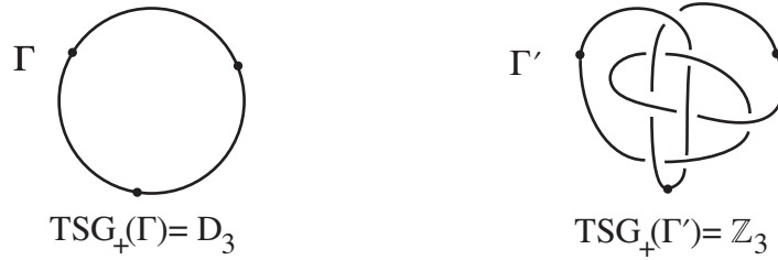
FIGURE 2. Embeddings of a triangle with different topological symmetry groups.

For example, let \gamma denote a circle with three vertices. If the embedded graph \Gamma is an unknotted circle, then \text{TSG}_+(\Gamma) = D_3 , the dihedral group with 6 elements. If we re-embed \Gamma as a non-invertible knot \Gamma' , then \text{TSG}_+(\Gamma') is the subgroup \mathbb{Z}_3 (in Figure 2, \Gamma' contains the non-invertible knot 8_{17} ). On the other hand, for any embedding \Gamma'' of \gamma in S^3 there will be an orientation preserving diffeomorphism of (S^3, \Gamma'') which cyclically permutes the three vertices (obtained by slithering \Gamma'' along itself) inducing an order 3 automorphism of \Gamma'' . Hence there is no embedding \Gamma''' of \gamma such that \text{TSG}_+(\Gamma''') is either \mathbb{Z}_2 or the trivial group. Thus not all of the subgroups of \text{TSG}_+(\Gamma) can occur as \text{TSG}_+(\Gamma''') for some re-embedding \Gamma''' of \Gamma in S^3 .