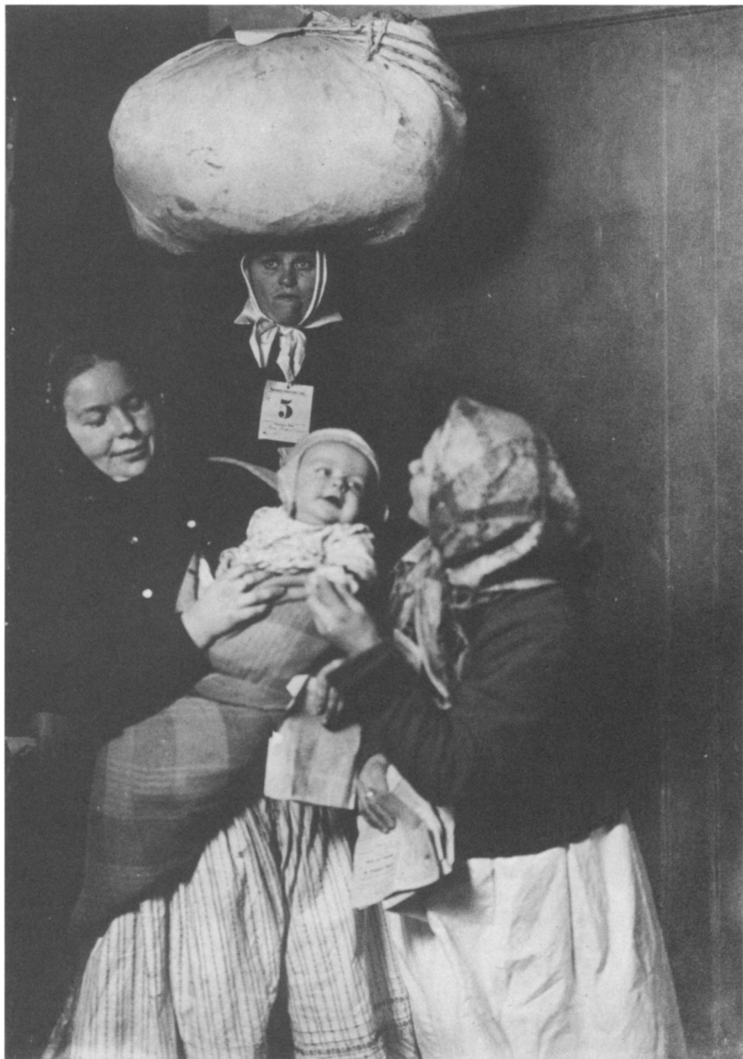
Fig. 3. Italian immigrants, Ellis Island, 1905.