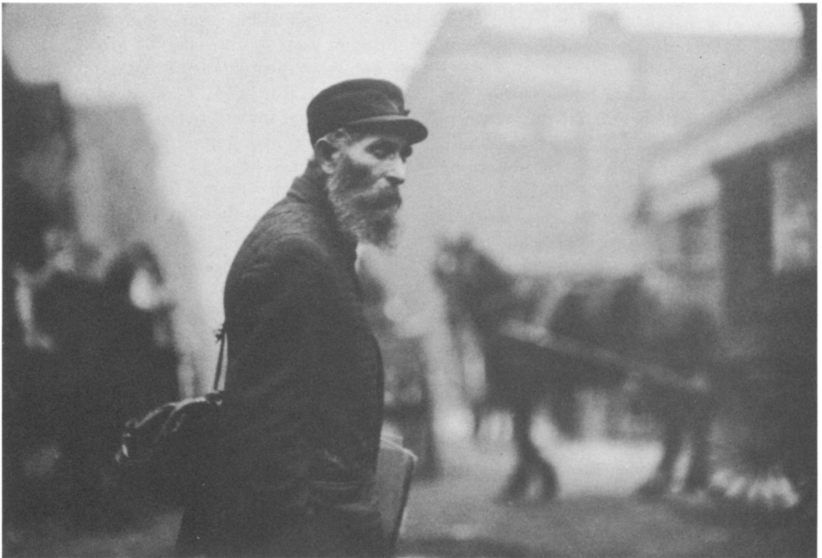
Fig. 10. Jewish peddler in Chicago, ca. 1910.