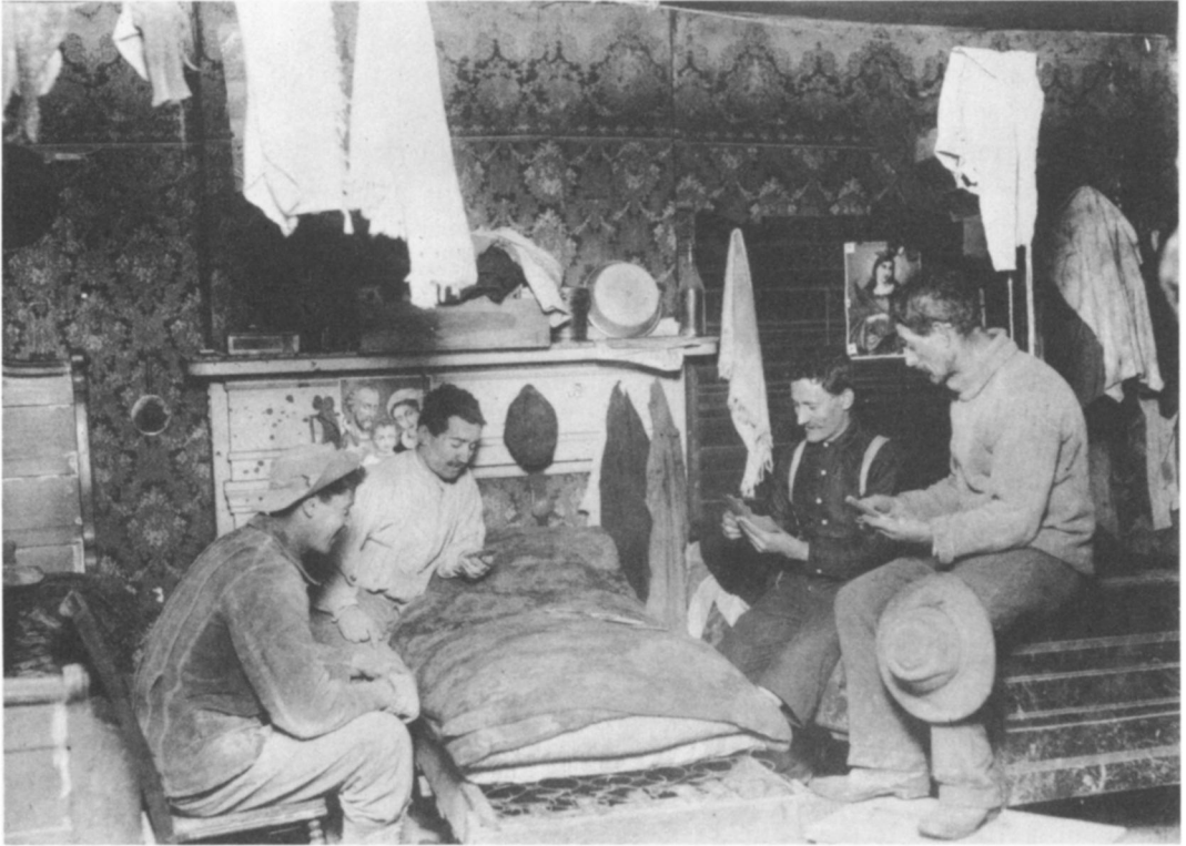
Fig. 4, above. Italian canal construction workers in western New York playing cards in a shack.