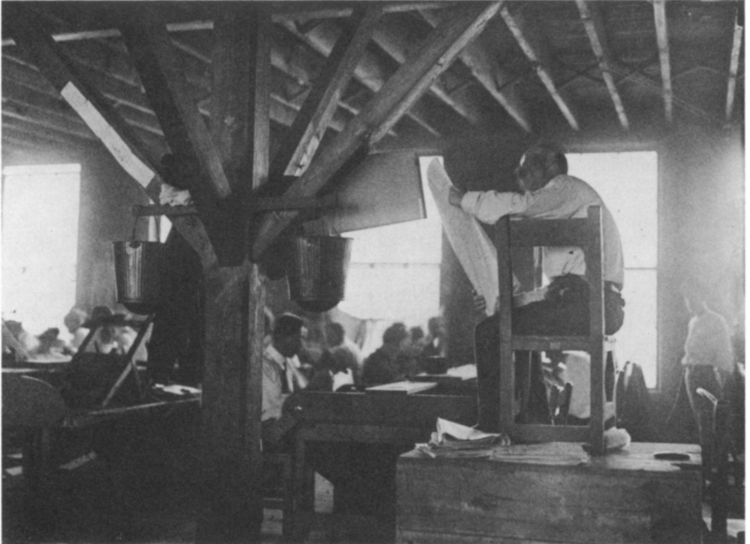
Fig. 8. "Reader" in a cigar factory (probably in New York City), 1909.

Not all artisans worked in factories, but some that did retained traditional craft skills. Mechanization came in different ways and at different times to diverse industries. Samuel Gompers recollected that New York City cigarmakers paid a fellow craftsman to read a newspaper to them while they worked, and Milwaukee cigarmakers struck in 1882 to