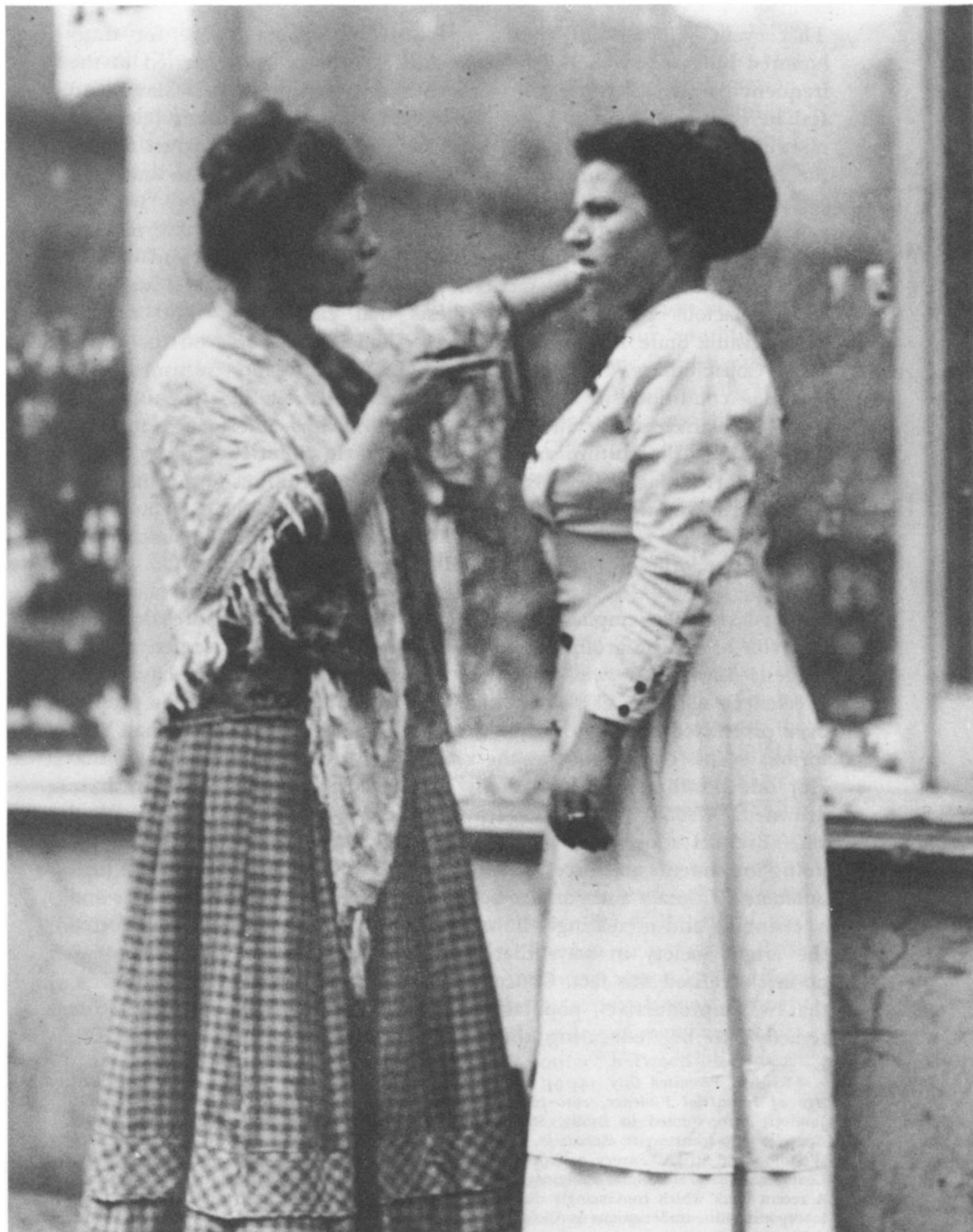
Fig. 9. Striker argues with a strikebreaker in New York City.