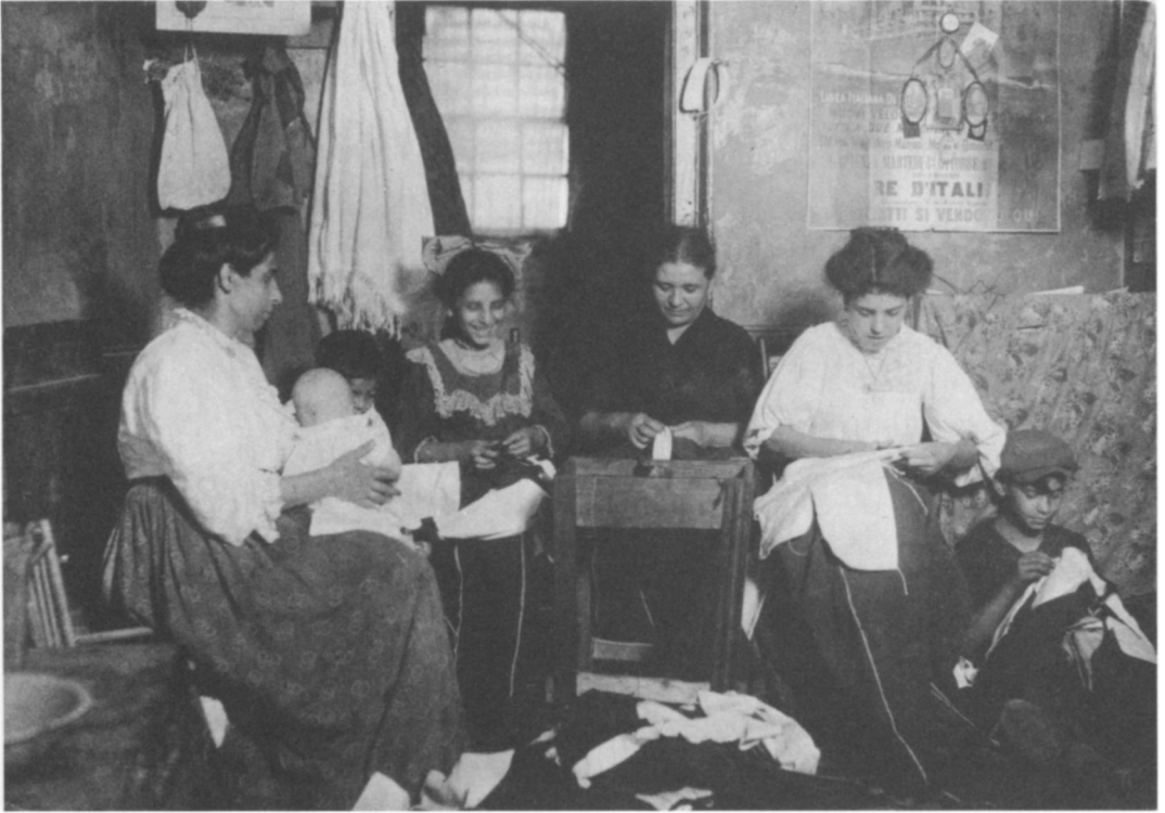
Fig. 6, above. Italian workers in a New York tenement-house sweatshop, 1909.