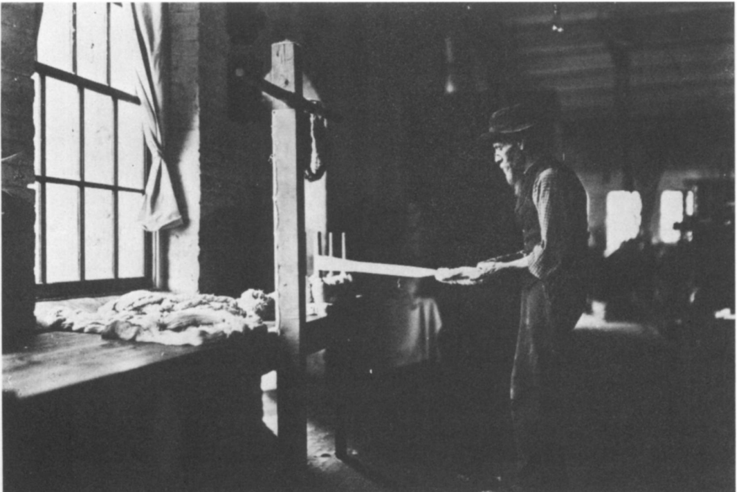
Fig. 5, below. Native white textile-mill worker in the South, 1912.